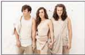
THE BAND PERRY